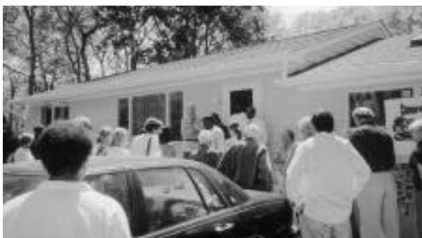
Well-wishers at the “White House” dedication.